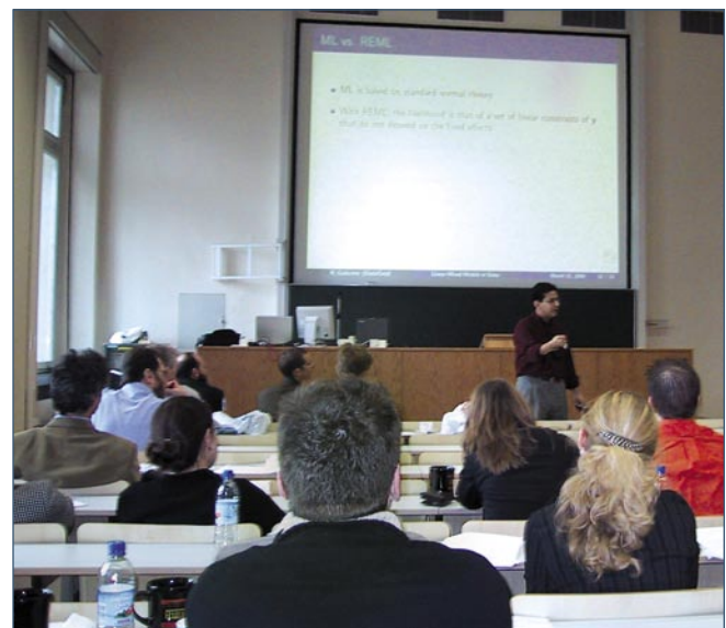
2006 German Stata Users Group meeting