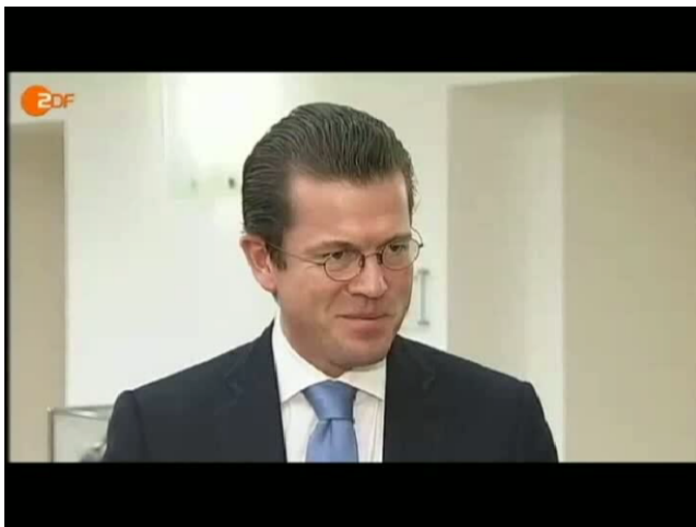
Karl-Theodor zu Guttenberg, February 2011 (German Minister of Defense at that time)