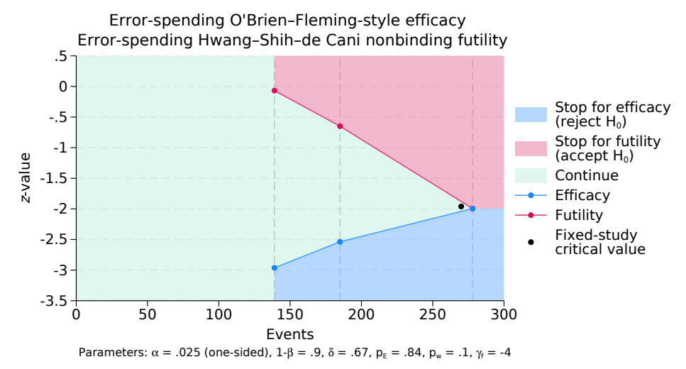
Figure 2. Error-spending efficacy and futility bounds for a one-sided log-rank test

The output of gsdesign logrank starts off quite similar to that of example 3, but the alternative hypothesis is now reported as Ha: HR < 1. By halving the significance level when transitioning to a one-sided test, we have kept the number of participants and events required by a fixed study unchanged.